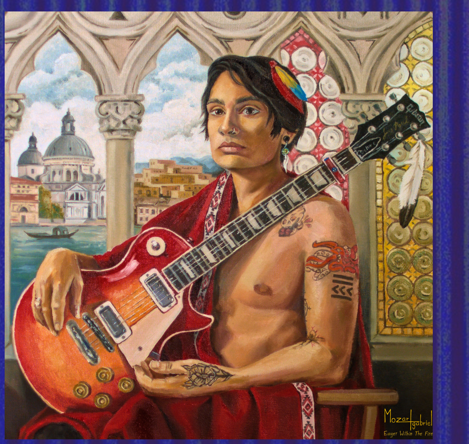
Eager Within the Fire