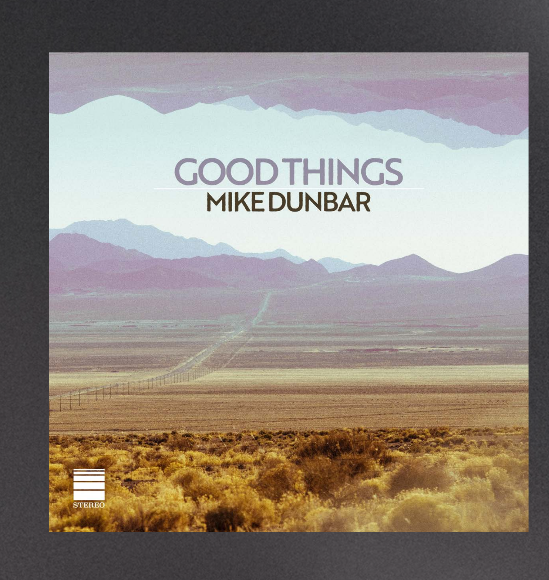
"Good Things" Single SEPTEMBER 10TH, 2021