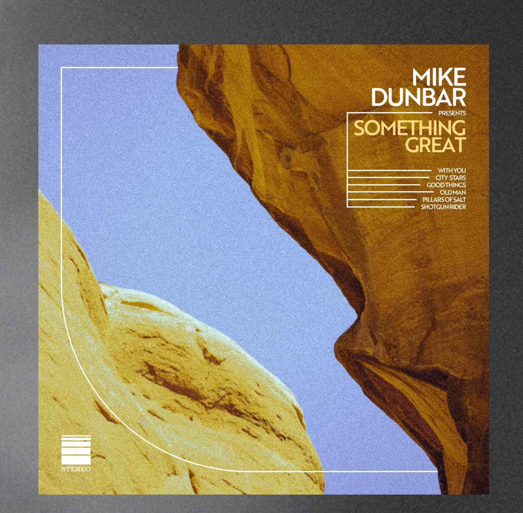
"Something Great" EP OCTOBER 22ND, 2021