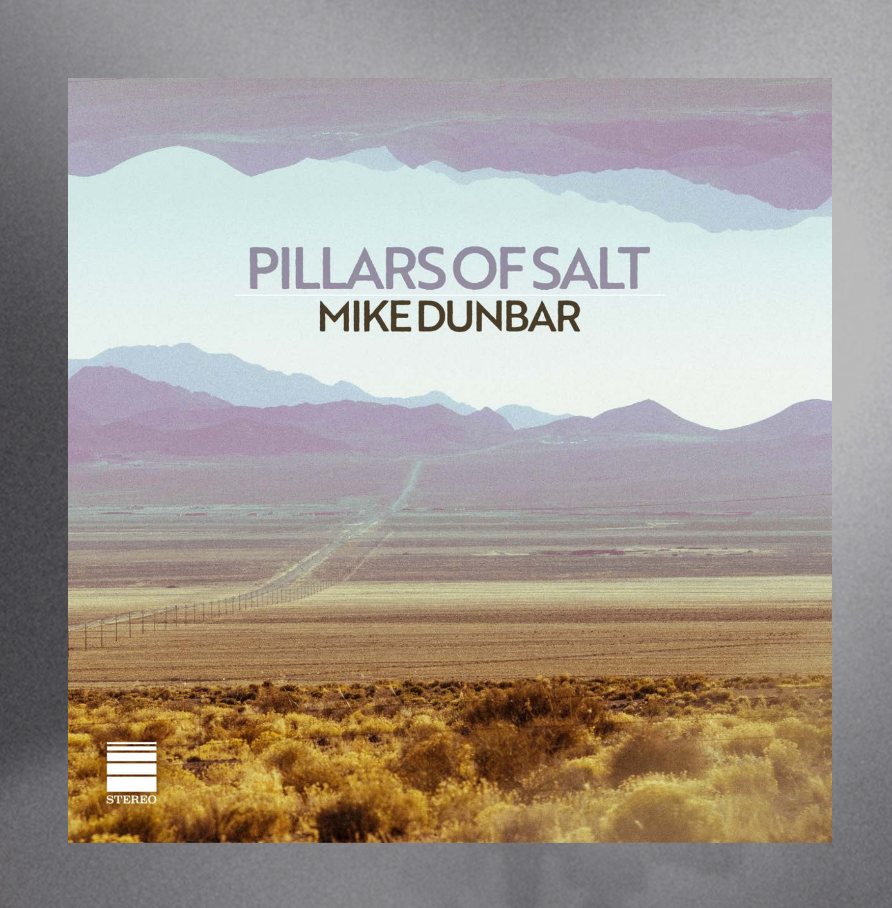
"Pillars of Salt" Single OCTOBER 8TH, 2021